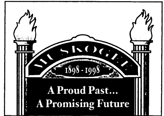
The arch has become a symbol of Muskogee's Centennial

Before the oil boom of the early 1900's,