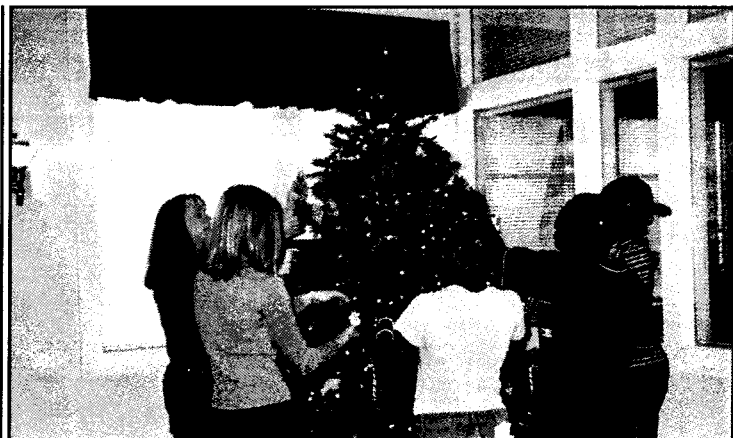
The History Buffs decorate the museum's Christmas tree.

The Christmas tree features a miniature steam engine and train that circles the tree on a track, puffing steam from its stack and blowing its tiny whistle. It will be a delight to both children and adults who visit the museum during the holiday season. A photo of this train was featured in the Muskogee Daily Phoenix .