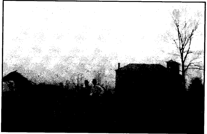
Spaulding Institute rose above the prairie of Muskogee