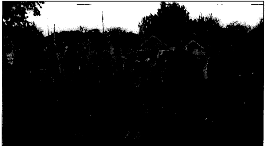
Many first-time visitors to the museum learn about the 6th Street Cemetery in Muskogee.

From Bacone, the caravan moved east to the Fort Gibson area. Here the explorers visited the Cherokee Citizens Cemetery, the Fort Gibson National Cemetery and the Fort Gibson Stockade where the old Army Hospital and the nearby historic McBride Home offered more spine-chilling stories of ghostly appearances.