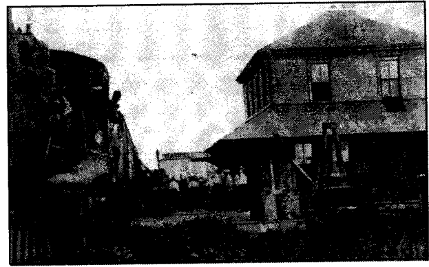
The Midland Valley Station in Haskell was one of the first structures in the town created by the railroad.

The Three Rivers Museum seeks artifacts on every town in the Three Rivers region. If you would like your town represented, consider donating artifacts, old photos and documents that tell the story of your hometown.